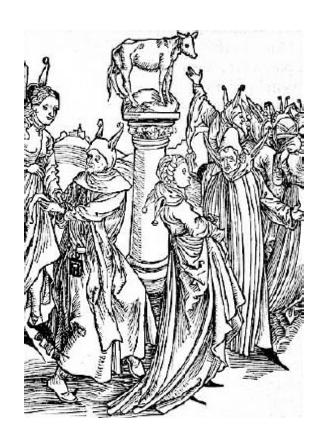
No Man Can Serve Two Masters For either he will hate the one, and love the other; or else he will hold to the one, and despise the other.