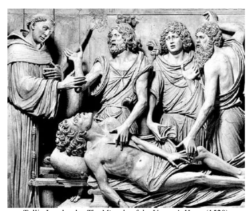
Tullio Lombardo, The Miracle of the Usurer's Heart (1520)

"Where your treasure is, there will your heart be also." —Matthew 6:21