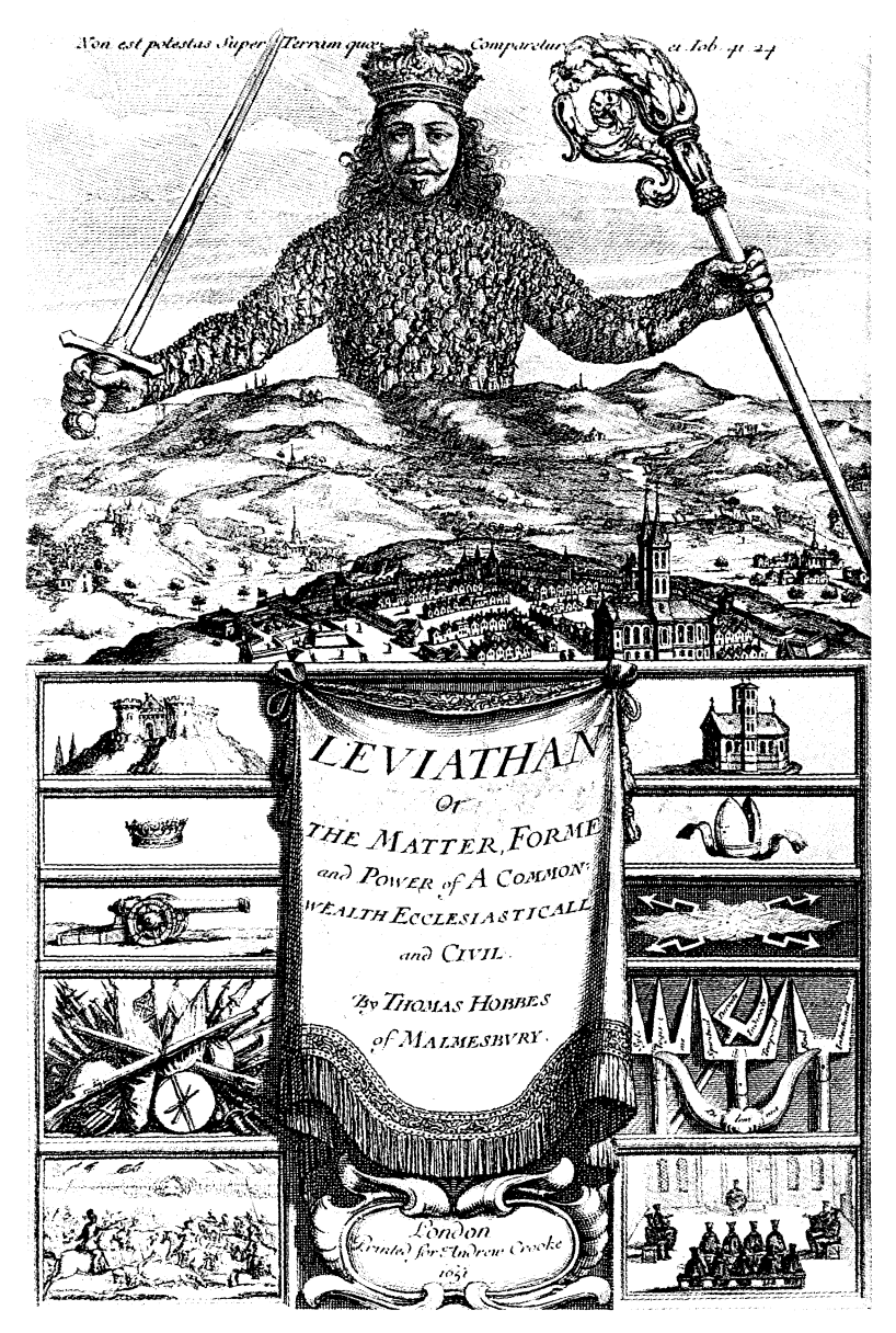
The engraved title-page of the Head Edition