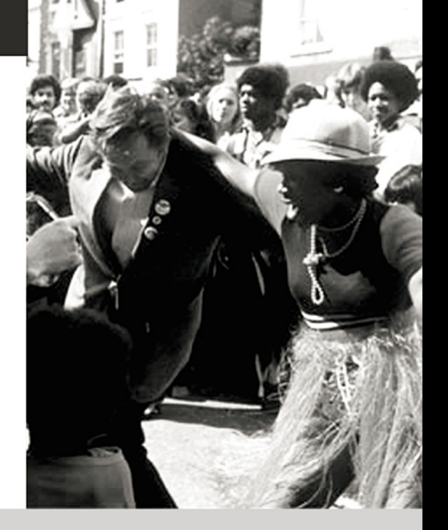
RACISM Second edition