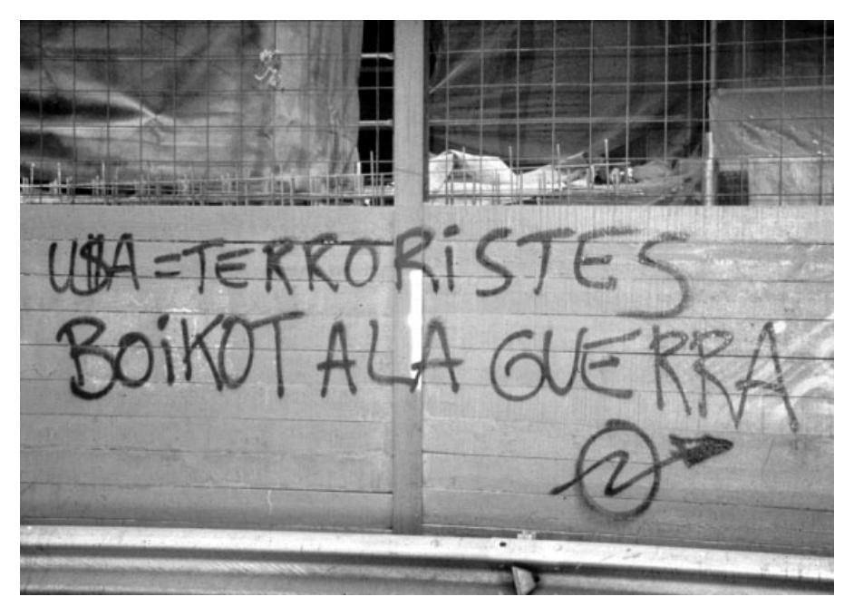
Illustration 29.1 Graffiti, Las Ramblas, Barcelona 1999

chatrooms, legal symbols like the flag, visual media in films and television, archival documentation that substantiates nationalist myths, as well as judicial rhetoric reinforcing particular codes of morality and ethics.