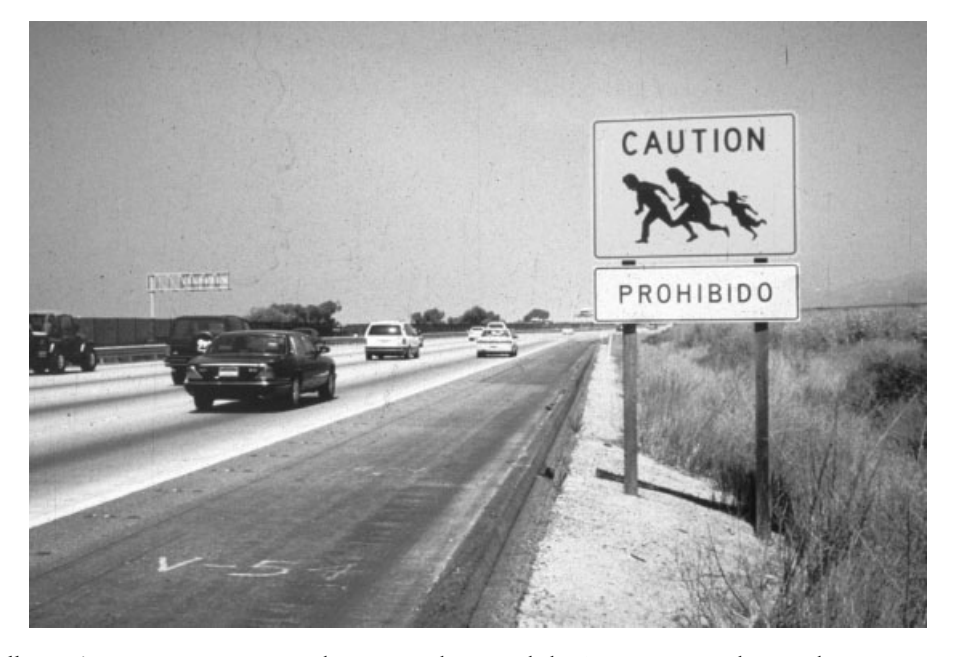
Illustration 29.2 Interstate 5 driving south toward the San Diego Border–roadsign warning motorists of fleeing illegal immigrants

Law as Janus-faced, operating as both a tool of resistance and oppression, is also a backdrop to Susan Coutin's work on El Salvadoran immigrants attempting to enter the Untied States and obtain permanent residency status from the early 1980s up to 1997. Legalizing Moves is first and foremost an exemplary ethnography in its sensitive and powerful presentation of observations and personal narratives that often involve harrowing topics of death and torture, and people's search to reinstate a sense of stability and cultural identity amidst immense suffering (Coutin, 2000: 24, 27–48). One of the most powerful messages that emerges in Legalizing Moves is that debates and conflicts over immigration law, and the determining of who qualifies at any particular time to legally reside in the United States, necessarily raise much bigger issues that center on what it means to be American (see also Calavita, 1992 for a compelling ethnography on the INS) (see Illustration 29.2). So while the plight