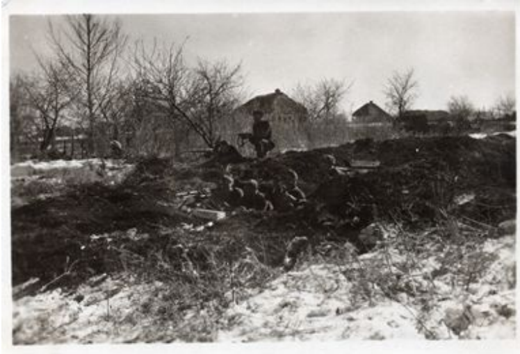
A group of well-armed Finnish volunteers in a

The Russian Army's Southwestern Front had stubbornly denied any retreat, and pushed their attack even when it impossible. The Russians had already miscalculated the German readiness and capabilities to perform offensive maneuvers, and Popov's mobile units were cut off, and supply lines were struggling to get fuel to the tanks. Manstein had launched several offensives to capture Kharkov, and the German forces were advancing again. This was the last time that the Finnish Battalion took part in a large motorized offensive. The battalion advanced almost 200 km between February 24 and March 4. The battles in between were mainly village skirmishes. They arrived at the southern banks of the River Donets just west of Izjum, located 120 km southeast of Kharkov. These positions were the last ones for the Finnish Battalion. On March 1, 1943, the battalion reported that its fighting strength was reduced to only eight officers, 37 NCOs, and 192 men. The whole situation stabilized into a trench war, but both sides started to prepare for rasputitsa season, and there weren't any more major battles in the Finnish sector. The battalion stayed in this sector from March 4 to April 10.