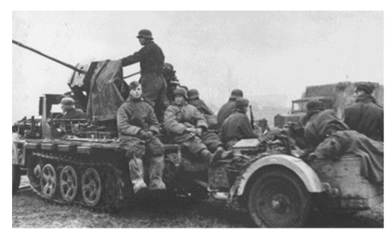
Waffen-SS 20 mm FLAK on a Sd. Kfz. 10/5.

I also want to mention the battles around the Waldai Heights (Novgorod Oblast) while we were on our way to Demjansk. I was a Funker attached to the 13.Kp. We had a few heavy 15 cm infantry guns on the left and right flank of our positions while in front of us we had the cover of 20 mm FLAK guns. We were prepared for a major Russian counterattack here. Suddenly, the order was given to open fire, and like a rolling thunder, our four infantry guns started spawning their deadly loads onto the Russian positions. I was sitting with my radio equipment in a foxhole while I was transmitting the coordinates to the "B-Stelle" ("B-Position") of our unit. While I was transmitting the coordinates, there was suddenly a heavy explosion. What happened? Carefully I came out of cover, head first, looking around me to see what had happened. I turned around and I noticed that one of our 15 cm guns had an exploded barrel. Clearly a misfire and the whole barrel exploded with serious consequences. The loader was hit in the abdomen by a piece of the gun port, and his intestines were hanging out of his body. He was screaming like crazy, asking the men to shoot him, but nobody reacted. None of us wanted to shoot him. A few minutes later, he passed away. This was my first war experience.