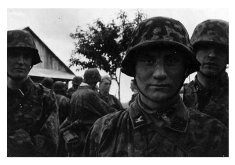
Young Waffen-SS soldiers – location unknown.