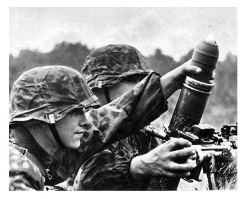
Waffen-SS in action on the Russian front with a heavy mortar.

On November 1, 1941, we were transferred to the front just south of Leningrad. Since winter had started early that year in Russia – mid-October to be more precise – we found a thick layer of snow upon our arrival with temperatures of -20 and even colder. At first we were accommodated in the homes of some local families. They were simple but very friendly people who took really good care of us. Sadly enough, most of their homes were destroyed by the Russian artillery barrages, so we had to relocate. This forced us to stay outside in the cold. We used our empty grenade and ammunition boxes to build some sort of shelter, but it wasn't that easy as the ground was frozen solid. Our uniforms were not the typical winter uniforms many people think we had; we didn't even had a "Wintermantel" ("winter jacket"). It was so cold, and we were freezing day in day out. Because of that, every day we were looking forward to get a warm meal and some hot coffee, just to warm up a little bit. Another thing we did to stay warm is to take the warm winter boots from dead Russian soldiers. Lots of us had frozen hands and feet which incapacitated us for a while. There was nothing you could do, as half of your body was frozen. My hands and feet were frozen during the winter of 1942 and 1943, which resulted in all the nerves in those body parts damaged.