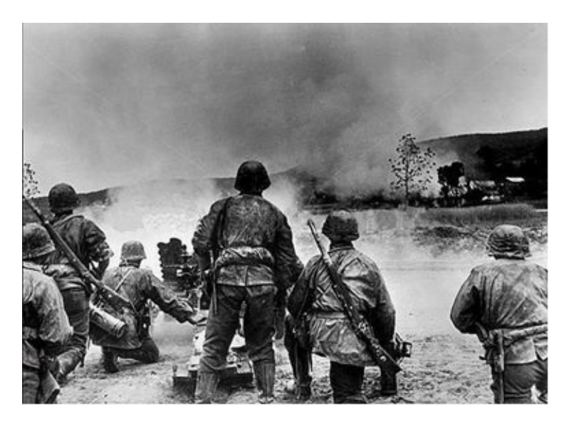
Panzerjäger in action in Russia 1941.

The commander of the SS Battalion was not impressed by the enemy's show of force. He treated the entire situation as if it was a practice drill: he sent one company to the right, supported by heavy MG and infantry; in the center, he kept the grenade launchers and PAK; on the left he put another company, with the Panzerjäger leading the way. The motorcyclists were tasked to comb through the woods. The furious firestorm hit the Soviets very hard! From all sides death and destruction rained on them. They desperately ran forward, hoping to get out of this hell as fast as they could, but the rage of our guns gave them no way to escape. Totally confused, they tried to escape. The Richtschützen of the PAK battery and artillery took every single enemy vehicle under fire. Every MG nest was wiped out by our grenade launchers, while the hordes of the charging infantry were all bombed with high explosive grenades (Sprenggranaten). Whatever was left over of the enemy troops just gave up. In a panic, they fled away to the north, followed by the fire of all our heavy weapons.