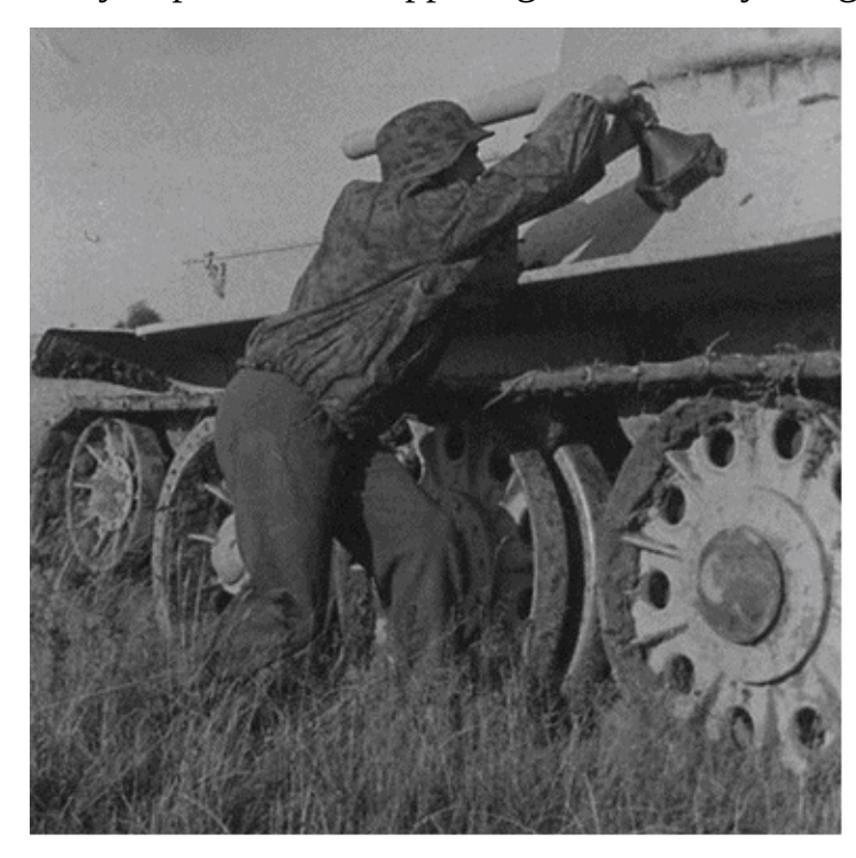
Waffen-SS soldier placing a Haftmine on a T-34.