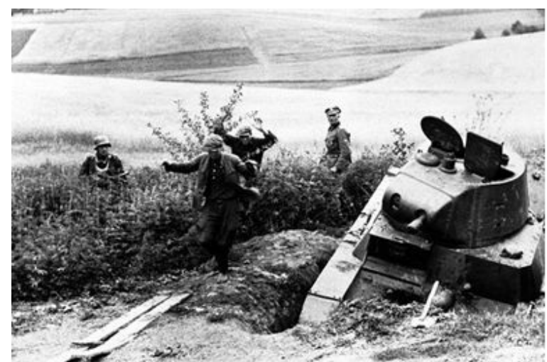
partisans/soldiers – location unknown.

could be on their way back again. The way back was easier, as they knew their way through the city now. Inside the city it was very quiet, and there were no more other vehicles around. Only in the distance one could hear the artillery still firing.