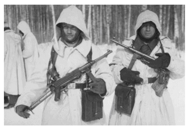
Waffen-SS troops in Demjansk.

a fury that was never seen before. But on January 12, we already had temperatures of -52 Celsius, and we had no winter equipment. We only had our summer uniforms while the snow was waist high. The "Ostheer" wasn't equipped for winter war: the turrets of our tanks were frozen solid and were unable to move and the engines of every motorized vehicle suffered a great deal as well. We had to break our bread with our rifle butts, and amputations of extremities became routine. Because of the cold, the activities at the front were slim to none, so we could move around freely. If we were able to move. Sometimes the "Iwan" would fire a couple of shots in the air just to let us know they were still there. Their weapons never seemed to fail during wintertime. At a certain point, they were able to shoot one of our communication cables. Obviously the "Funker" were called, and we had to grab a new cable and look for the broken one to fix it. This was not an easy task at -50 Celsius while moving through very deep snow. Once the cable was fixed, we had to report back.