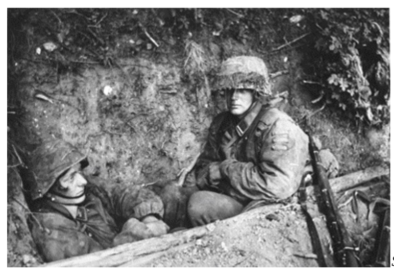
Sharing a fox hole...

At night, we got the order that when a green light ball appeared, it meant we had to retreat. There were lots of light ball shot in the air that night, but we hadn't seen a green one. It was already day again, and there was still no command to move. The Russians stopped shooting a while ago, so we kept quiet until the evening. Then we realized that the Russians were on the left and right of our platoon's location. We were fortunate enough to have an experienced platoon leader; maybe 20 or 30 soldiers were left in our platoon. We could hear the Russians with their trucks, they were very close, but they probably thought we were all gone, otherwise it would've been the end for us. As soon as it was safe to move, we gathered around our platoon leader and we started marching. We moved through creeks and bushes, as this was a lot safer than using the regular roads. We had a lot of confidence in our platoon leader, as he seemed to know what he was doing. We also had to avoid towns, open terrain, etc. We marched without a compass or maps and somehow, to our great despair, we realized all of a sudden that we were behind the Russian lines! So we were marching in the wrong direction!