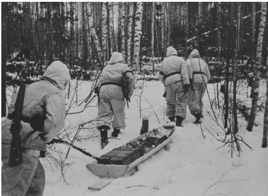
The year was 1947.