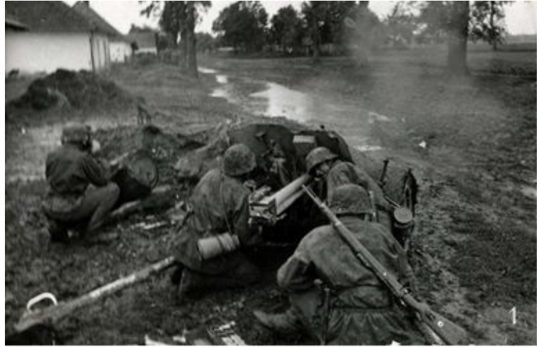
Pak 36 in action in Russia.