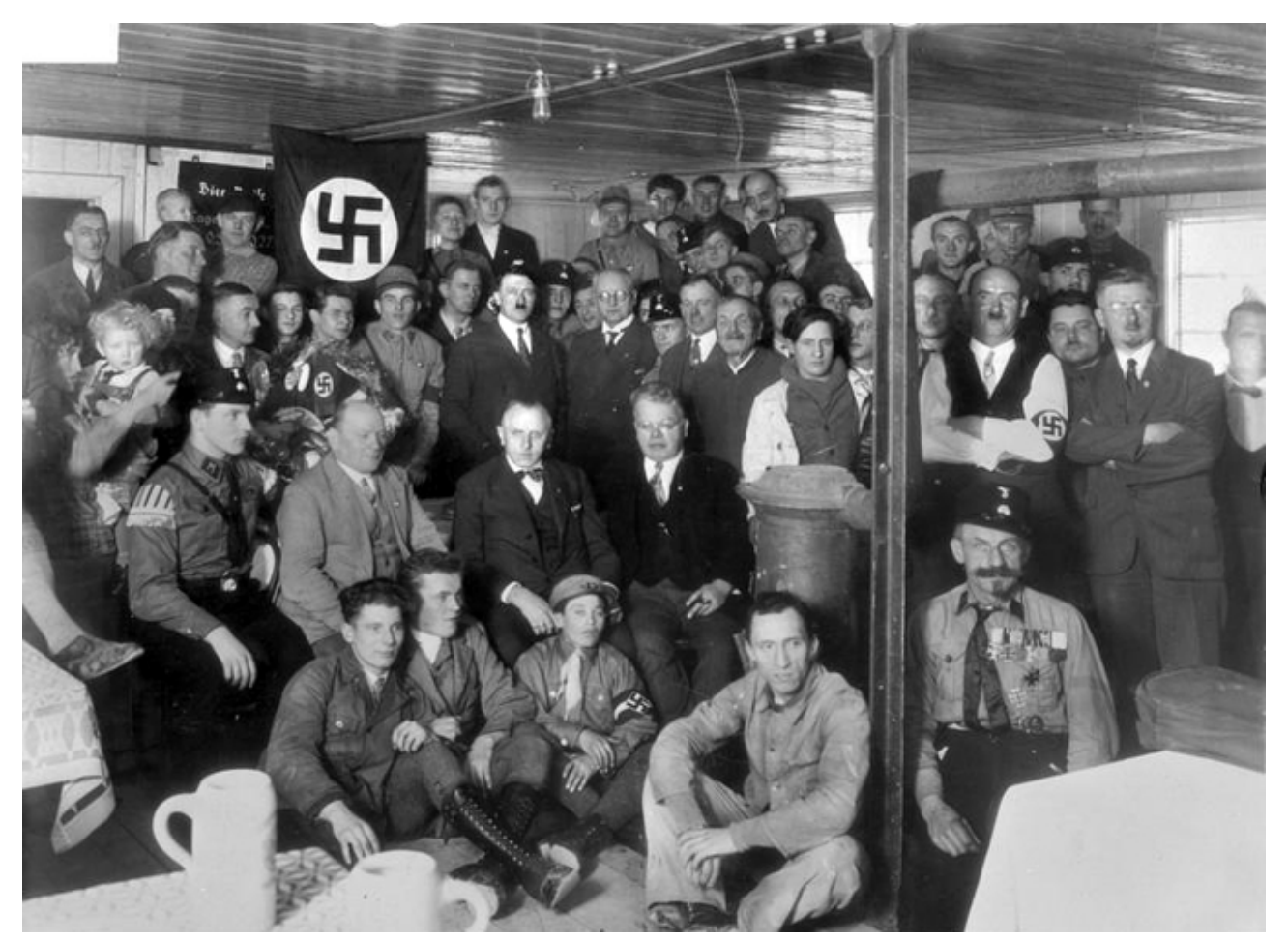
Adolf Hitler and Nazi Reich treasurer Franz Xaver Schwarz at the inauguration of the renovation of the Palais Barlow in Briennerstrasse the "Brown House," Munich 1930.