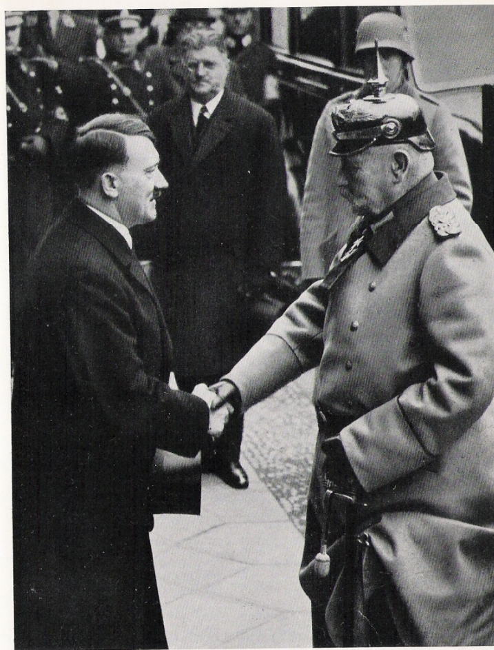
THE LATE PRESIDENT VON HINDENBURG AND ADOLF HITLER IN 1934

Towards morning it was repeatedly rumoured that Kahr, Lossow and Seisser had withdrawn from the new Government. As a matter of fact they were prisoners in the hands of the army generals who were deputizing for Lossow. Entirely on their own