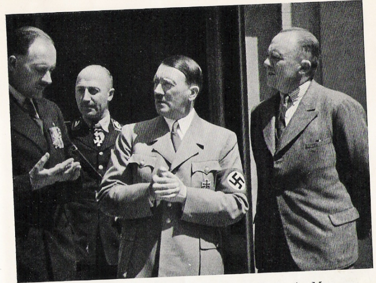
Hitler speaks with a Delegation of British Ex-Service Men

As the President's regular period of office was nearing its end a step was taken which brought Hitler into the foreground in negotiations with certain persons in the Reich Government. Chancellor Brüning endeavoured to get Hitler to consent to