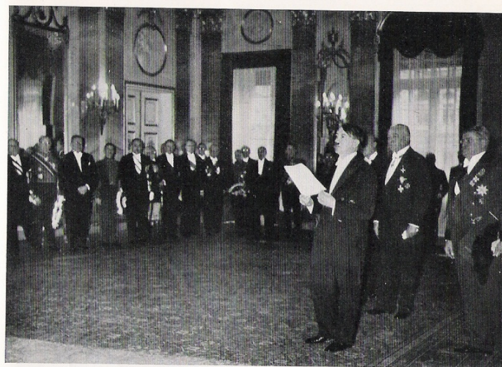
New Year Reception of Foreign Ambassadors

of Germany. On the occasion of the Party Congress in 1929 well over 100,000 persons made a pilgrimage to the old imperial city. Twenty-four new standards were presented to the S. A. following a solemn commemoration service for the dead at the War Monument in the Luitpoldhain. The march-past of the S. A. at the close of the ceremony, when Hitler took the salute, lasted close on four hours and formed an imposing demonstration.