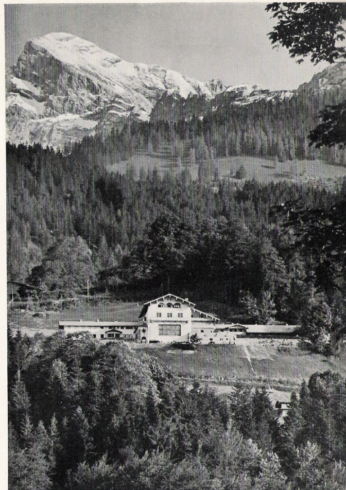
THE BERGHOF Hitler's House on the Obersalzberg

A fresh election was held on November 6. This time the result showed a reduction from 13,400,000 to 11,800,000 of the votes cast in his favour. There was a corresponding reduction in the number of National Socialist deputies, from 230 to 196. Hitler's opponents were jubilant over the result. Hitler obstinately refused to be satisfied with the Vice-Chancellorship and the Government adopted a dictatorial attitude on the other side. The situation which thus resulted created among many people the impression that Hitler had missed his opportunity and that his movement was weakening. But the jubilant cries of his opponents were short-lived. Hitler had the courage and firmness of mind to wait. At the end of January, 1933, the then Chancellor, General Schleicher, stood completely isolated. On January 28 his entire Cabinet resigned and on January 30 the