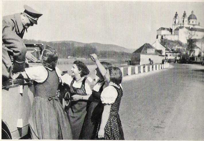
Hitler on his way to Vienna, March 12, 1938

requirements Hitler is extremely modest. He does not eat meat or take any alcoholic drinks; nor does he smoke. This is simply because he feels it suits his health better to be abstemious in regard to these things.