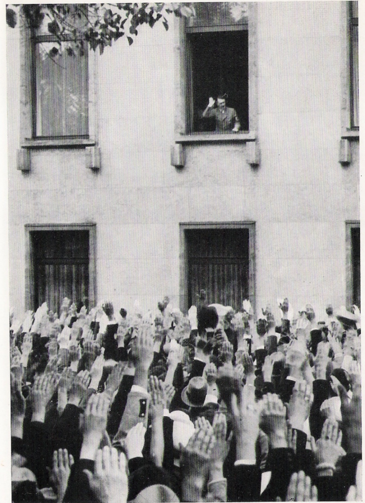
THE FÜHRER AT THE WINDOW OF THE REICH CHANCELLERY, 1934

Hitler took upon himself the full and sole responsibility for everything that had happened. Speaking in his own defence he stated in the course of a brilliant speech that the overthrow of Marxism was his aim but that this was considered essentially as a necessary pre-condition for the establishment of German