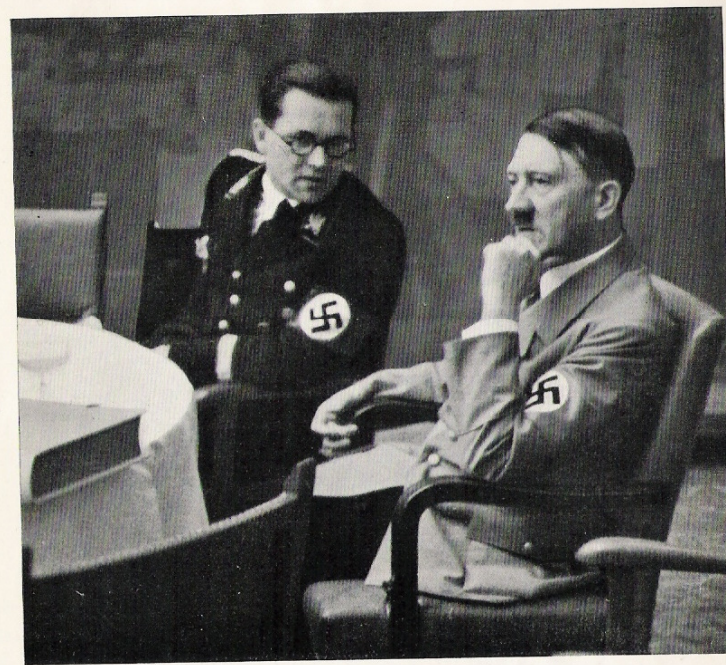
Adolf Hitler and Philipp Bouhler, the author of this biography

To understand all this one must understand and appreciate the character and personality of Adolf Hitler himself. Broad-