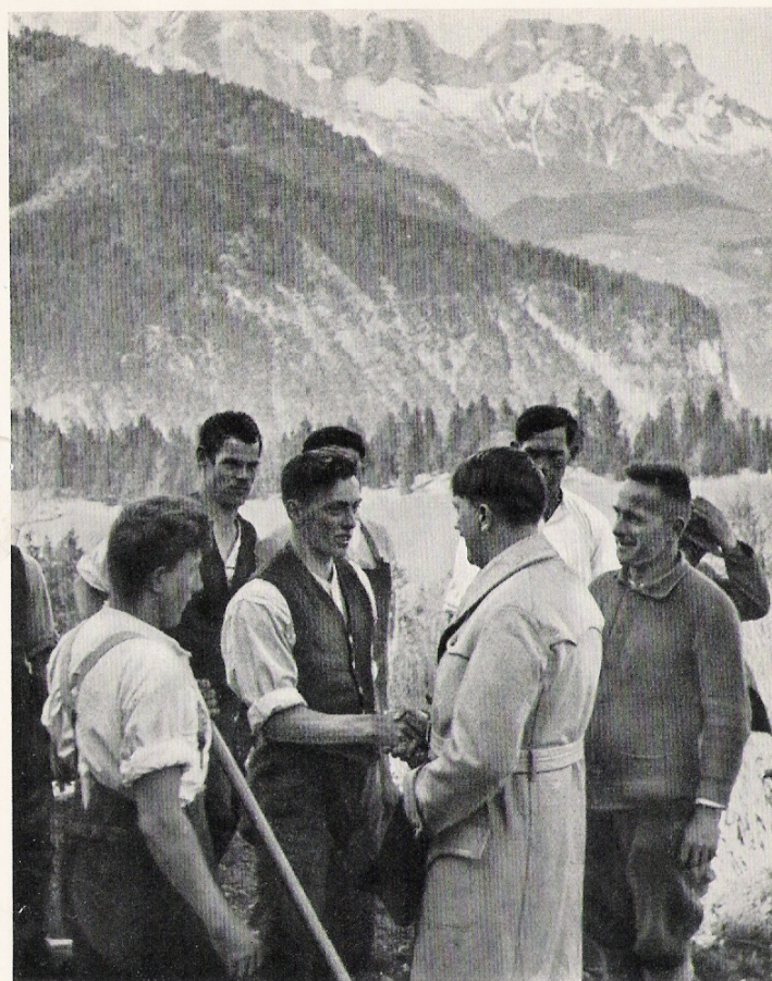
A HEARTY HANDSHAKE WITH THE WORKMEN

In his third electoral campaign, in which he used an aeroplane for purposes of rapid travel, Hitler was the central figure of the battle and went through the length and breadth of the country as a triumphant hero. Within a fortnight he spoke at 49 mass meetings. The electorate gave 13,700,000 votes for the National Socialist candidates, with the result that the latter now acquired