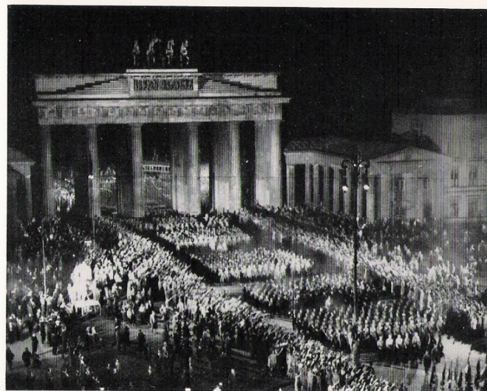
Berlin, January 30, 1937

On the same date, November 9, 1923, the General State Commissar issued an order dissolving the German National