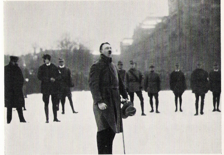
"On January 28, 1923, the first National Socialist Party Congress was held on the Marsfeld in Munich . . ."

The process of doing so went forward very slowly. The first meeting was composed only of the original seven members, with one or two onlookers. So meagre were the propaganda resources that the number of people who attended subsequent meetings increased only to 11, 13, 17, 23 and 34 respectively. At the meeting after that 111 persons were present. Hitler now spoke regularly at meetings and in that way became conscious of his oratorical gifts. He induced the committee to entrust the