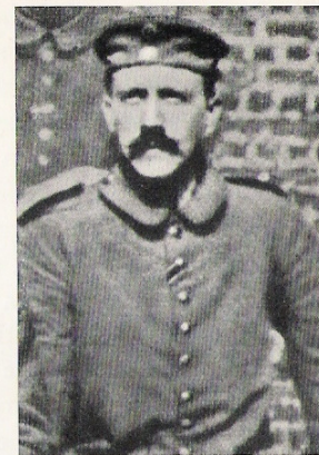
The Nameless Soldier

Though the years spent in Vienna meant a hard and bitter struggle with life, the experience gained in this school was of inestimable value afterwards. Hitler was now yearning to live as a German in Germany itself, free from the oppression under which the German element had to suffer in that potpourri of nations which made up the Habsburg Empire. So he left Vienna and came to live in Munich. That was on April 24, 1912.