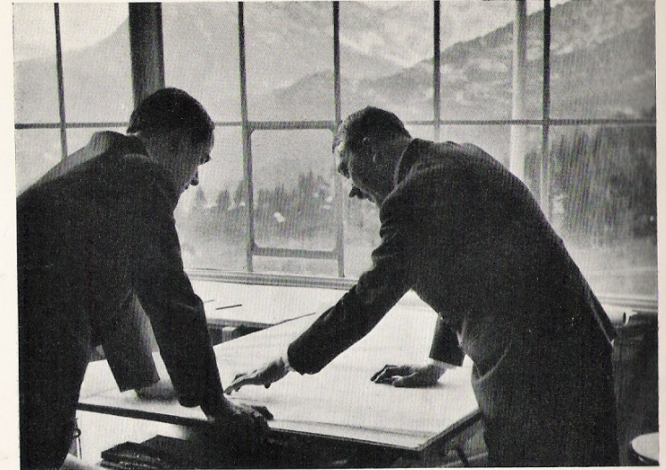
In Hitler's Studio at Obersalzberg

On March 23, 1933, the Führer asked for four years in which he could put into practice his measures for the restoration of the German nation. The law which gave him unlimited powers for this purpose was constitutionally passed by Parliament. After the expiry of this period, when he had given a public