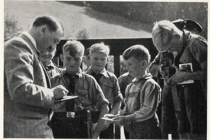
Some young Autograph Hunters

The magnitude of the victory won on March 5 was unparalleled in German history. And it was as unexpected as it was unparalleled. 17,300,000 people cast their votes for Hitler,