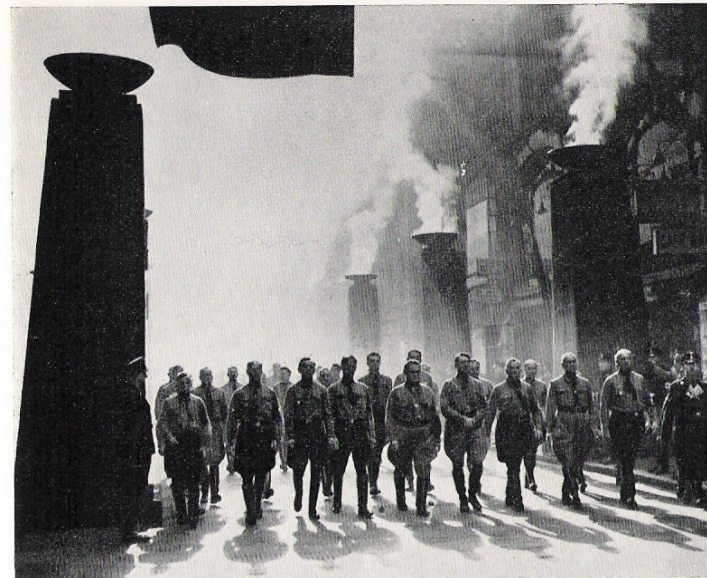
Procession in Munich, in Commemoration of November 9, 1923

There were temporary working coalitions with other associations but they lasted only for a short time. In these cases Hitler's