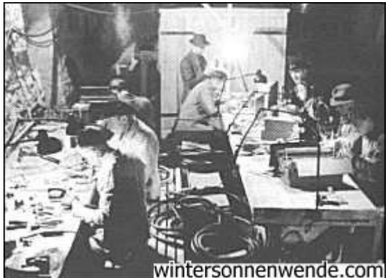
Technicians work on improving rocket technology in an underground factory.

But most Americans know about German World War II rockets. A few even know that in addition to the car engine the Germans also invented the jet and perfected the