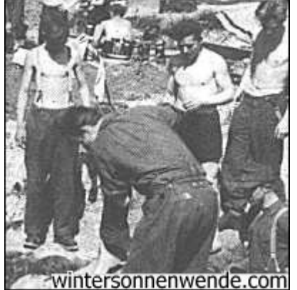
Just three days after the end of World War II, German soldiers dig earth

According to the U.S. Zone Report of October 1945, 66,500 "prominent Nazis" had been interned in the American Zone as of September 1945. By the end of that year, another 70,000 "prominent Nazis" had been interned in the British Zone. In addition, 156,000 persons were "dismissed" from public service in the British Zone between May, 1945, and September, 1946, and 86,000 applications from other persons who tried to obtain employment in one of the restricted