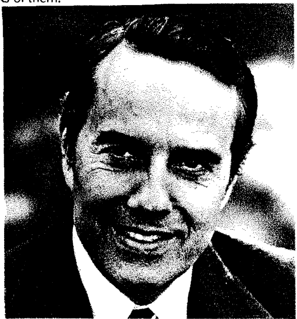
Old wine-not even in a new bottle

he 1996 presidential campaign may well prove to be a watershed event in the coming polarization of the U.S. The shameful actions of the national Republican Party with respect to the candidacy of Patrick Buchanan have probably doomed this country to another four years of Bill Clinton. The comments made by Senator Dole and other senior Republican leaders were effective in braking the gathering momentum of Buchanan's populist campaign, the only campaign that was raising serious, fundamental questions about the direction the country has taken and what needs to be done. Without endorsing Buchanan, with whom we have deep differences on several key points, we can only look on with mounting disgust at the cynical, cowardly calculations of the Country Club Republicans and Fat Cats who pull the strings in the Republican Party. Yes, the Republican Establishment beat Buchanan, but it will soon be handed the bill for its merry pranks. The people who supported Buchanan, and many others as well, now know what the Republican elite really thinks of them.