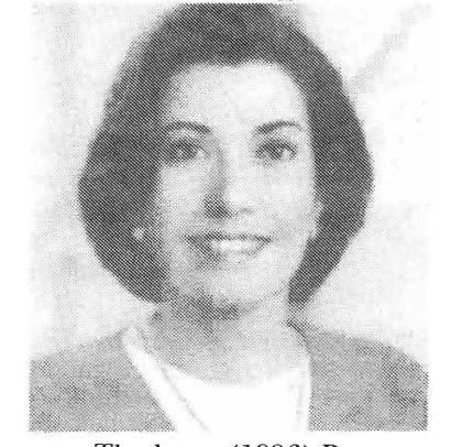
The latest (1996) Betty