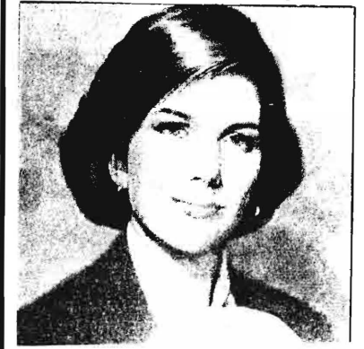
General Mills' 1986 version