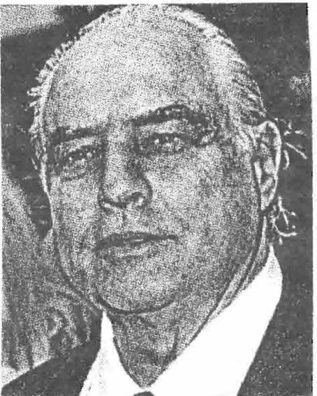
The young Brando......and the grotesque oldster

made the systematic, massive and perpetual violation of the rights of another indigenous people the foundation stone of its very existence.