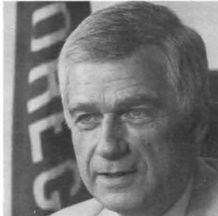
Hatfield -- is he or isn't he?