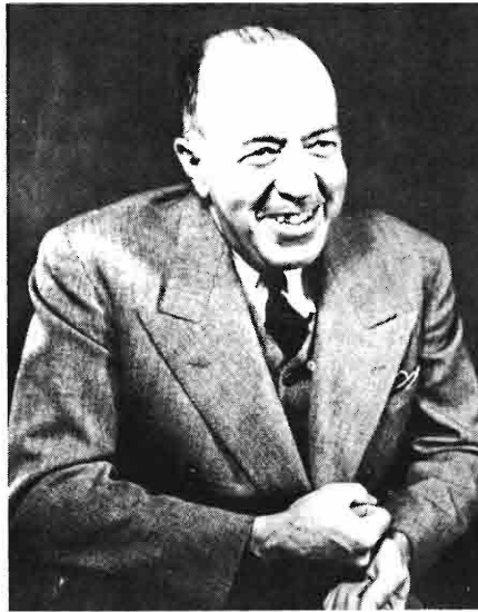
Edgar Rice Burroughs

A race of green Martians also existed, but these were hardly human and probably of reptilian ancestry. A particularly