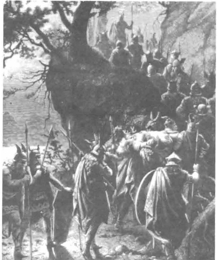
Siegfried's funeral procession from Götterdämmerung .

Nevertheless, if it takes such negativism to compose the supreme art of the Ring , then we can only praise it and revert to a Hegelian synthesis or some tricky synergistic math to explain it. In the case of Wagner, the sum of plus and minus turned out to be greater than the original plus.