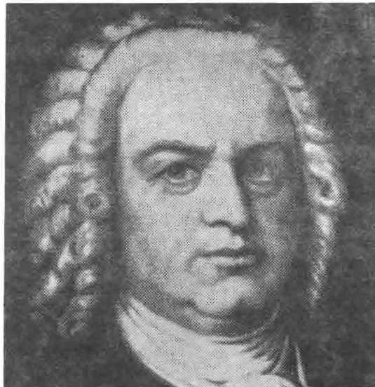
J.S. Bach -- first jazz improviser?

Modernization comes at a price. For every further refinement, the emotional security of a simple world is endangered. The age of faith gives way to the age of confusion. We could best think this out in terms of supply and demand (a dualism, I