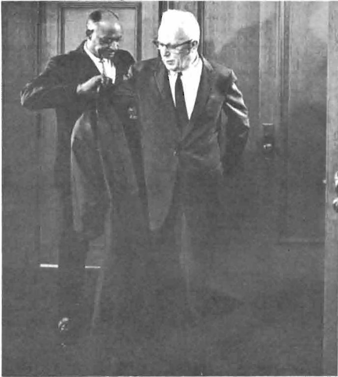
Earl Warren, the Great Desegregator

The twenty had grown to more than half a million