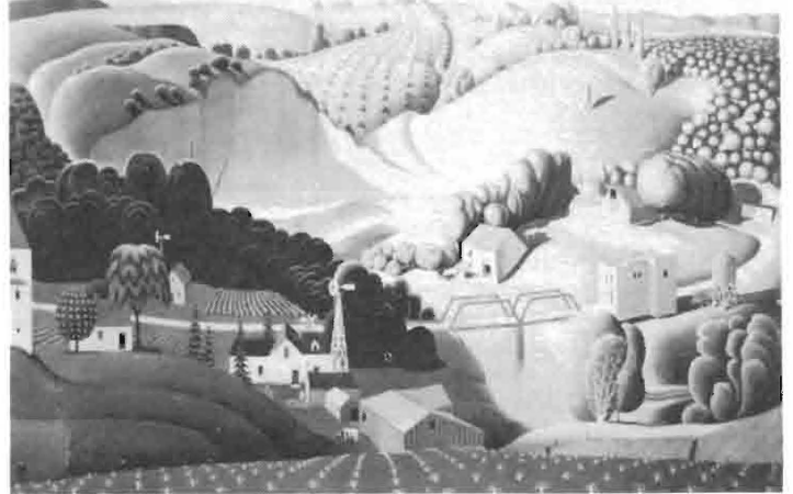
STONE CITY by Grant Wood