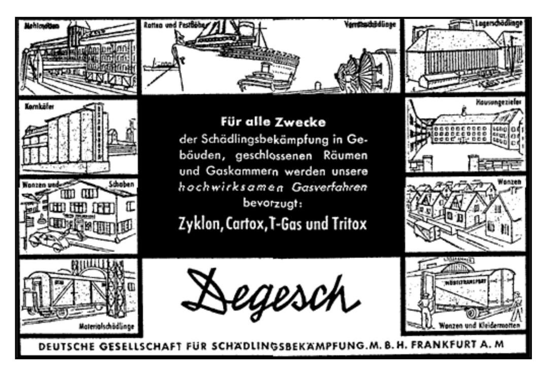
Figure 1: Typical advertisement (half size) by the DEGESCH Company showing large gas chambers, including one for railroads in the lower left corner.4

The half-page advertisement which follows appeared in dozens of issues of Der praktische Desinfektor just as an example.3