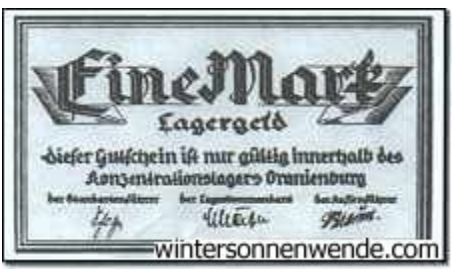
Oranienburg was the first known camp to have Lagergeld for its prisoners. The issues for this particular camp were in 5 Pfg. (green), 10 Pfg. (blue), 50 Pfg. (brown) and 1 Mark denominations. (Printed 1933 - August 1934, when the camp closed.) Unlike Theresienstadt, these notes were fairly plain without multiple