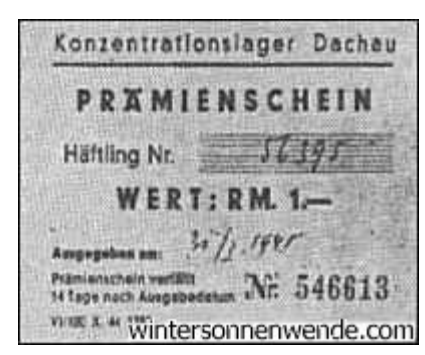
A Dachau camp note.

"At a death camp it would seem that there was very little need for money." ( The Shekel , Vol. XVI, No. 2, March-April 1983, p. 43.)