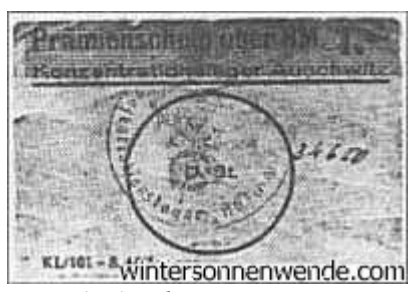
An Auschwitz camp note.