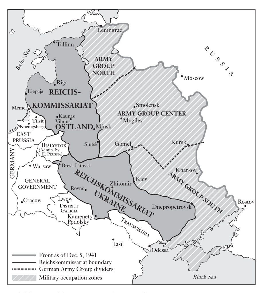
3. OCCUPIED SOVIET TERRITORY, DECEMBER 1941