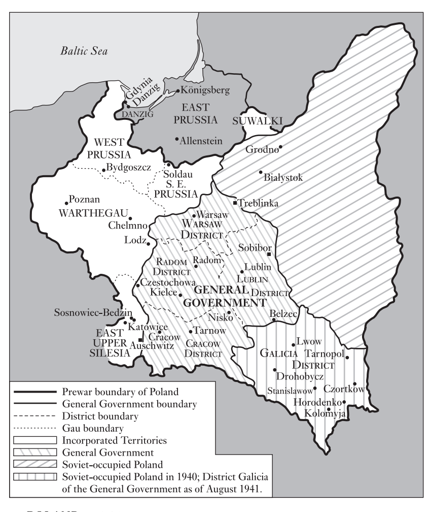
I. POLAND, 1940