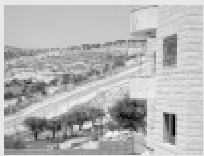
The Separation Fence dividing homes from fields and towns.

For others Easter brings renewed hope; hope that the occupation will be lifted and the violence will end, hope that their children will no longer feel constant fear, hope that peace will come to this land, hope that the message