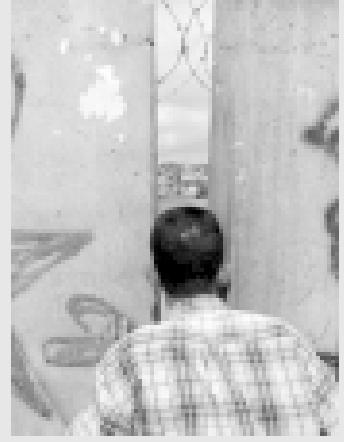
Looking through the Wall to Mount of Olives.

a land where religious freedom is supposed to be the right of all people. The construction of the security wall, in some places a concrete wall 30 feet high, in other areas a swath of land 150 feet wide with electronic motion detectors, razor wire fencing, and patrolled security roads, prevents Christians from going from their homes to their churches. In some places the wall is being built down the middle of a main road. If a