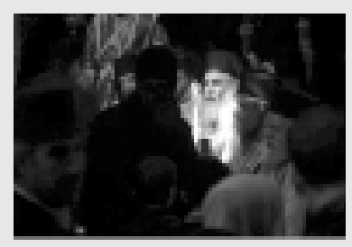
Priest carrying the Holy Fire

times by the eldest and most respected men of the congregation, while children follow behind throwing flower petals. (In a traditional burial service the casket is carried around the church instead.). Even though