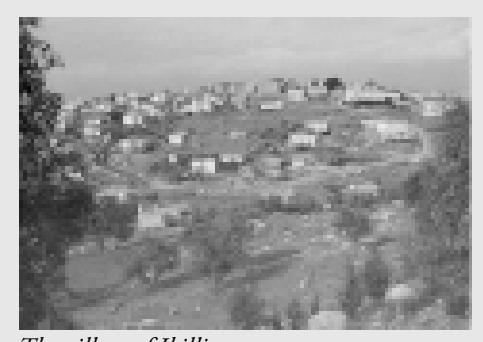
The village of Ibillin

At first I just stood when everyone else stood and sat when everyone else sat, not understanding what was being said or the symbolism behind any of the traditions involved; the swinging of the incense, the blessing