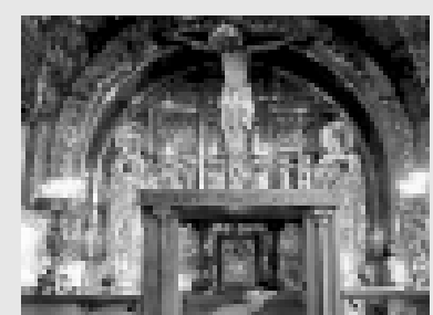
Golgotha, Site of the Crucifixion

The next day is called "Juma Hazini", Sad Friday, or "El Juma Al adtheema al Muqaddas", The Great Sacred Friday. None of the "Good Friday" euphemisms here. The death knell begins to ring at noon, the tra-