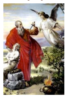
Sacrifice of Abraham , St. Joseph's Basilica, Webster, Mass

Blood sacrifice has been a recurring theme in Judaism from the beginning.