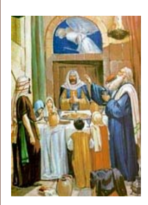
The Destroyer Passes Over 12 For I will pass through

A dominant theme of both ancient Hebrew and subsequent Jewish culture is the Holy Atrocity. The ancient Hebrews, most often acting upon direct orders from LORD God, exterminated entire ethnic groups, tribes and nationalities. Men, women, children, and livestock were slaughtered, cities burned, and artwork destroyed. Sometimes LORD God directed the Hebrews to massacre each other, and sometimes others attacked LORD God's people. (26)