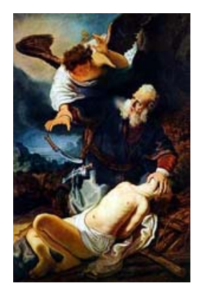
Abraham's Sacrifice , by Rembrandt, 1635

It would be wrong to let that misunderstanding persist. The Talmud of the Jews and the Old Testament of the ancient Hebrews clearly demonstrate that mass exterminations were a way of life; modern ceremonies show that in all the centuries, Judaism has not repudiated those doctrines.