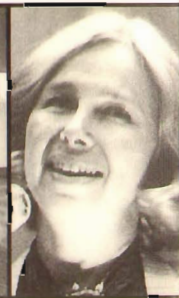
Georgie Anne Geyer