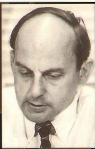
Adlai Stevenson III