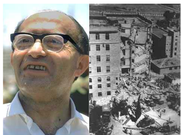
Menachem Begin: terrorist and mass murderer

In their effort to wrest control of Palestine from British control, the Zionists waged a campaign of relentless terror, including the bombing of the King David Hotel, which killed 93 people. They ruthlessly murdered British officials and soldiers. The Zionists assassinated anyone in their way, including the world-respected U.N. mediator, Count Folke Bernadotte, who dared to tell the world of the Zionist terror and murder campaign. A favorite tactic of the Irgun and Stern terrorist gangs was to kidnap British soldiers and slowly torture them to death. Israel was also the first nation to employ the modern terrorist technique of the letter bomb; and over the years sent out hundreds of them, killing dozens of their enemies and