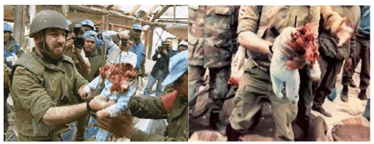
The gory reality of Israel's terrorism. Workers remove the victims (mostly women, children and elderly) killed in by Israeli forces in Lebanon, including the decapitated child shown above.

Israel's slaughter of civilians in this terrible 10-day offensive - 206 by last night - has been so cavalier, so ferocious, that not a Lebanese will forgive this massacre. There had been the ambulance attacked on Saturday, the sisters killed in Yohmor the day before, the 2-year-old girl decapitated by an Israeli missile four days ago. And earlier yesterday, the Israelis had slaughtered a family of 12 - the youngest was a four- day-old baby - when Israeli helicopter pilots fired missiles into their home.