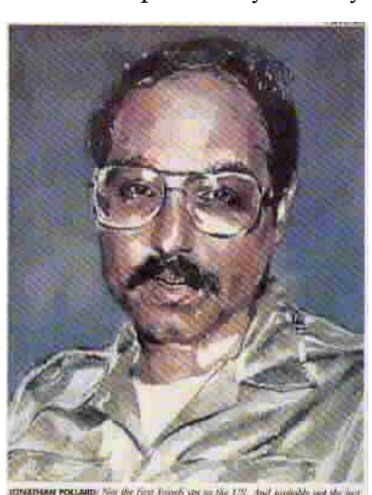
Jonathan Pollard: Israel's spy

Israel's use of Pollard's information not only destroyed our intelligence operations in the Mideast; it practically destroyed our intelligence apparatus in the Soviet Union and the