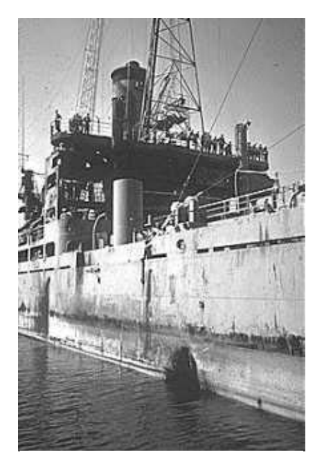
Israel's terrorist attack on the USS Liberty left killed 34 Americans.

grounds than we have for attacking Israel. No evidence exists that Afghanistan approved of or even knew anything about the attack on the World Trade Center; but in the Lavon Affair, the Israeli government committed a direct act of war against the United States. We, of course, did