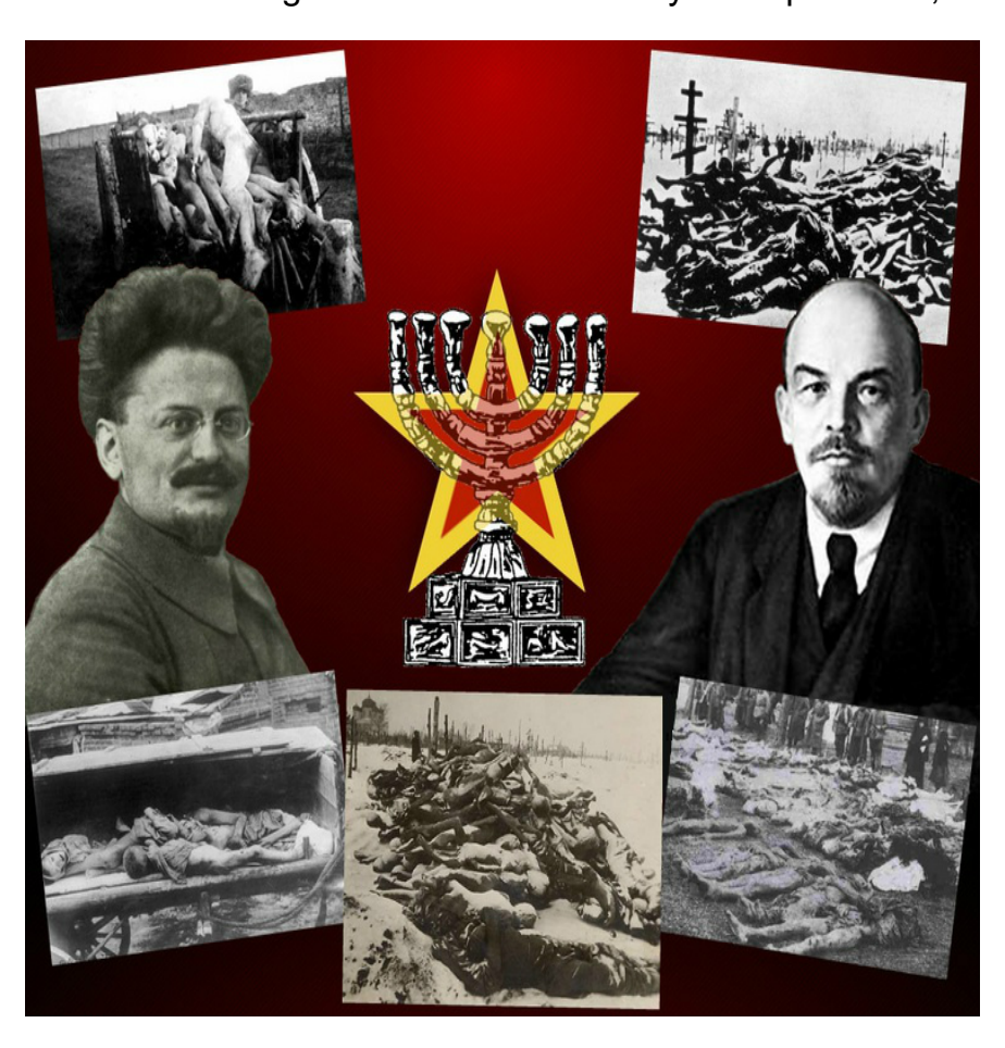
Death and destruction -- the legacy of Jewish Communism!

Words cannot do justice in describing the merciless bloodlust of these Marxist Jews. Many of the leading Jewish rulers of Russia forthrightly announced their murderous desires and genocidal ambitions. All the Jewish Bolshevik leaders were teeming with an implacable hatred for everything Russian and sought to exterminate the very concept of race, nationality and culture.