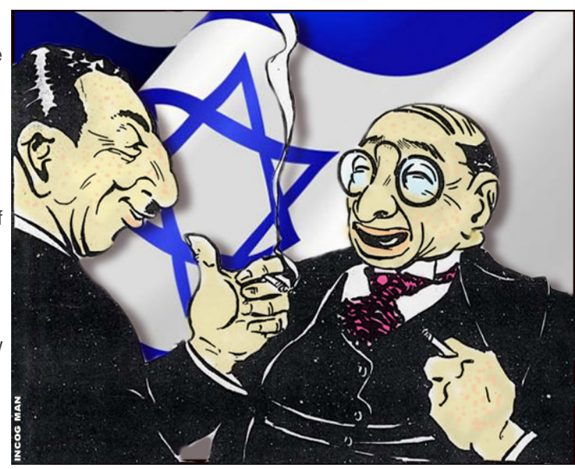
Zionism and Communism are but two arms of the Jewish World Swindle.

was never to "free the workers" from capitalist oppression, but