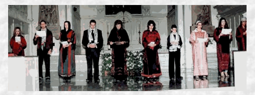
DEIR YASSIN STILL REMEMBERED. RECITATION OF THE NAMES OF THE VICTIMS OF BEGIN'S MASSACRE APRIL 2002, ST. JOHN'S CHURCH