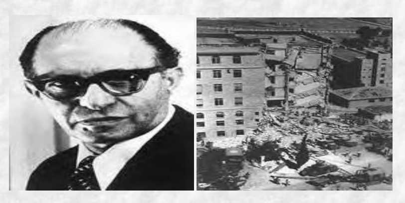
TERRORIST MENACHEM BEGIN KING DAVID HOTEL, BEGIN'S BLOODY WORK

The brutal and criminal circumstances surrounding the creation of Israel are now a half century in the past. Even most Arabs understand that Israel isn't going to go away. But by reviewing this real history, we can better understand the deceptive, dangerous, and brutal nature of international Zionism today.