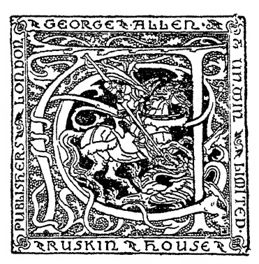
GEORGE ALLEN & UNWIN LTD LONDON. 40 MUSEUM STREET, W.C. 1 CAPF TOWN 73 ST. GEORGE'S STREET SYDNEY, N.S.W.: WYNYARD SQUARE AUCKLAND, N.Z.: 41 ALBERT STREET TORONTO 77 WELLINGTON STREET, WEST