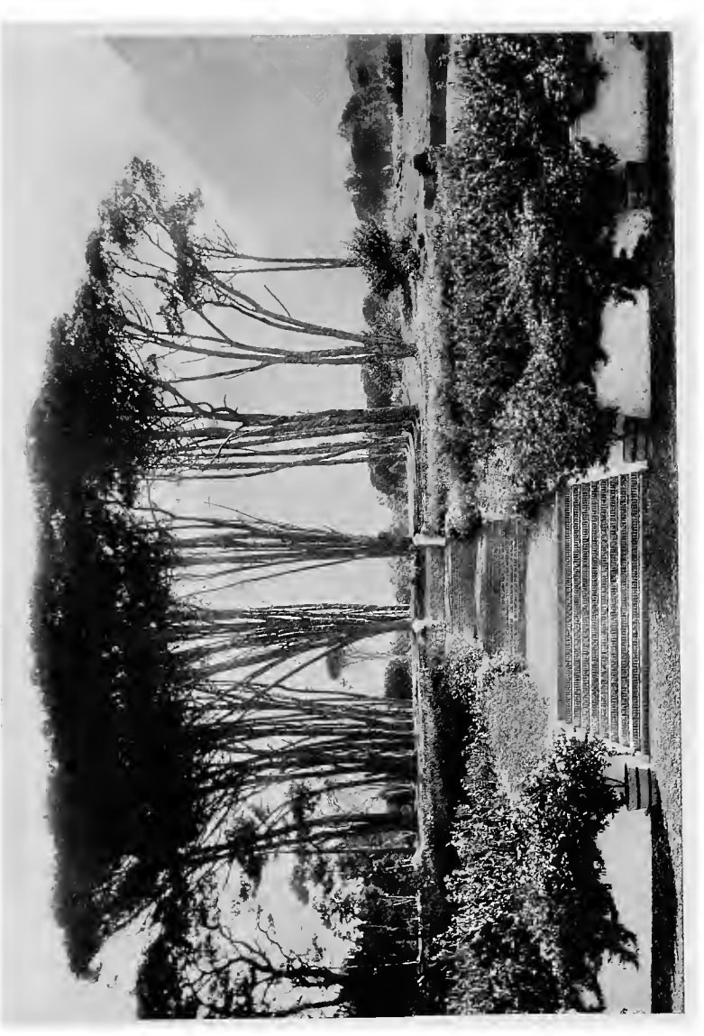
Digitized by Microsoft®