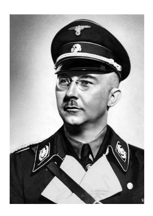
Reichsführer SS Heinrich Himmler (1938)