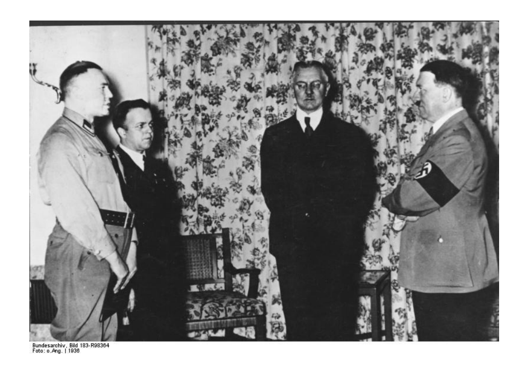
Adolf Hitler in discussion with Reich Minister of Economics and Reichsbank President Dr. Hjalmar Schacht in 1936

National economy was a widely held legacy of the German school of economics founded by Friedrich List in the 19th century, the aim being national autarchy as distinct from the English school of international free trade. National economy governed German thinking like Free Trade governed British thinking. At a glance, List stated: "I would indicate, as the distinguishing characteristic of my system, NATIONALITY. On the nature of nationality, as the intermediate interest between those of individualism and of entire humanity, my whole structure is based." It was an aim that German businessmen readily embraced.