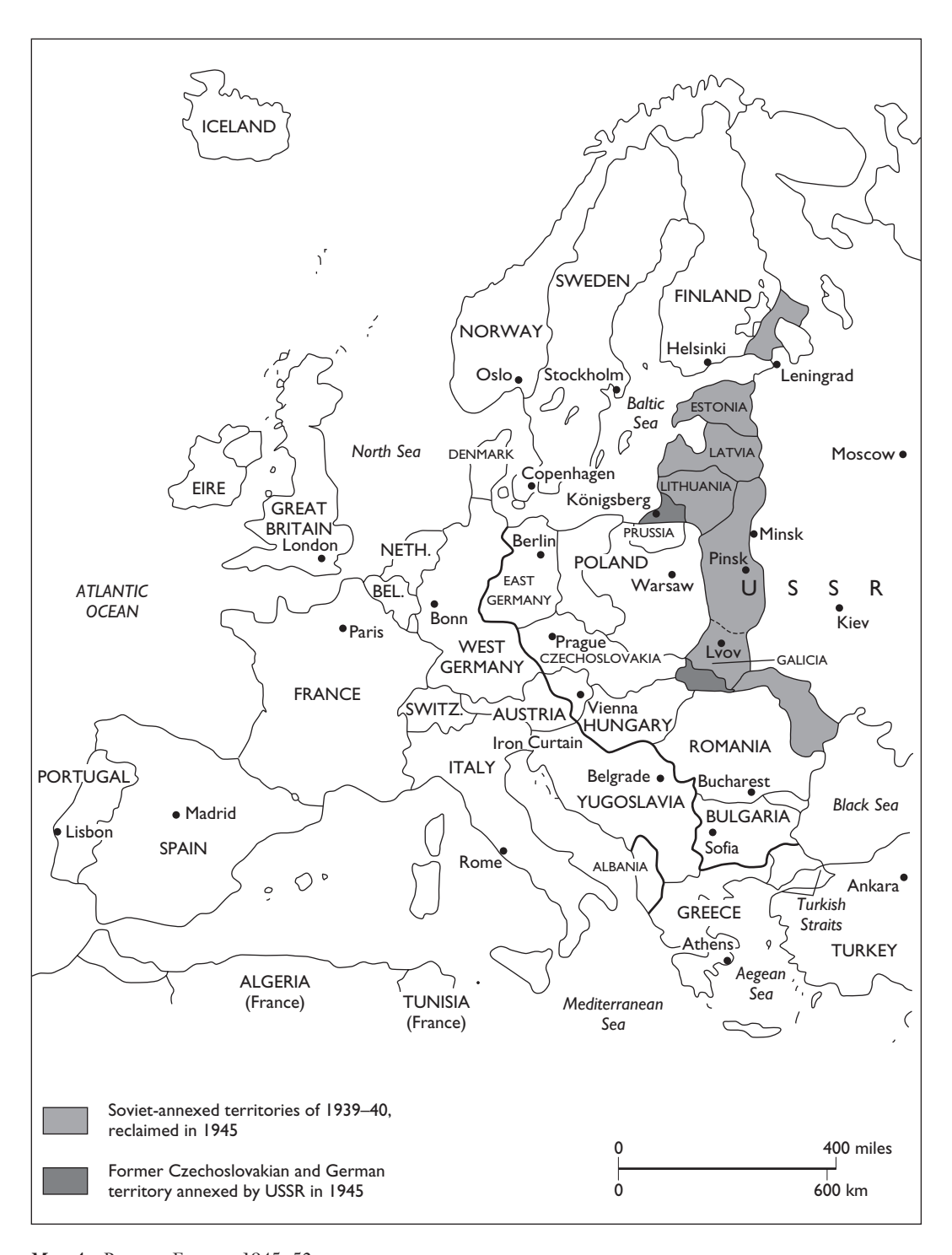
Map 4 Postwar Europe, 1945–52.