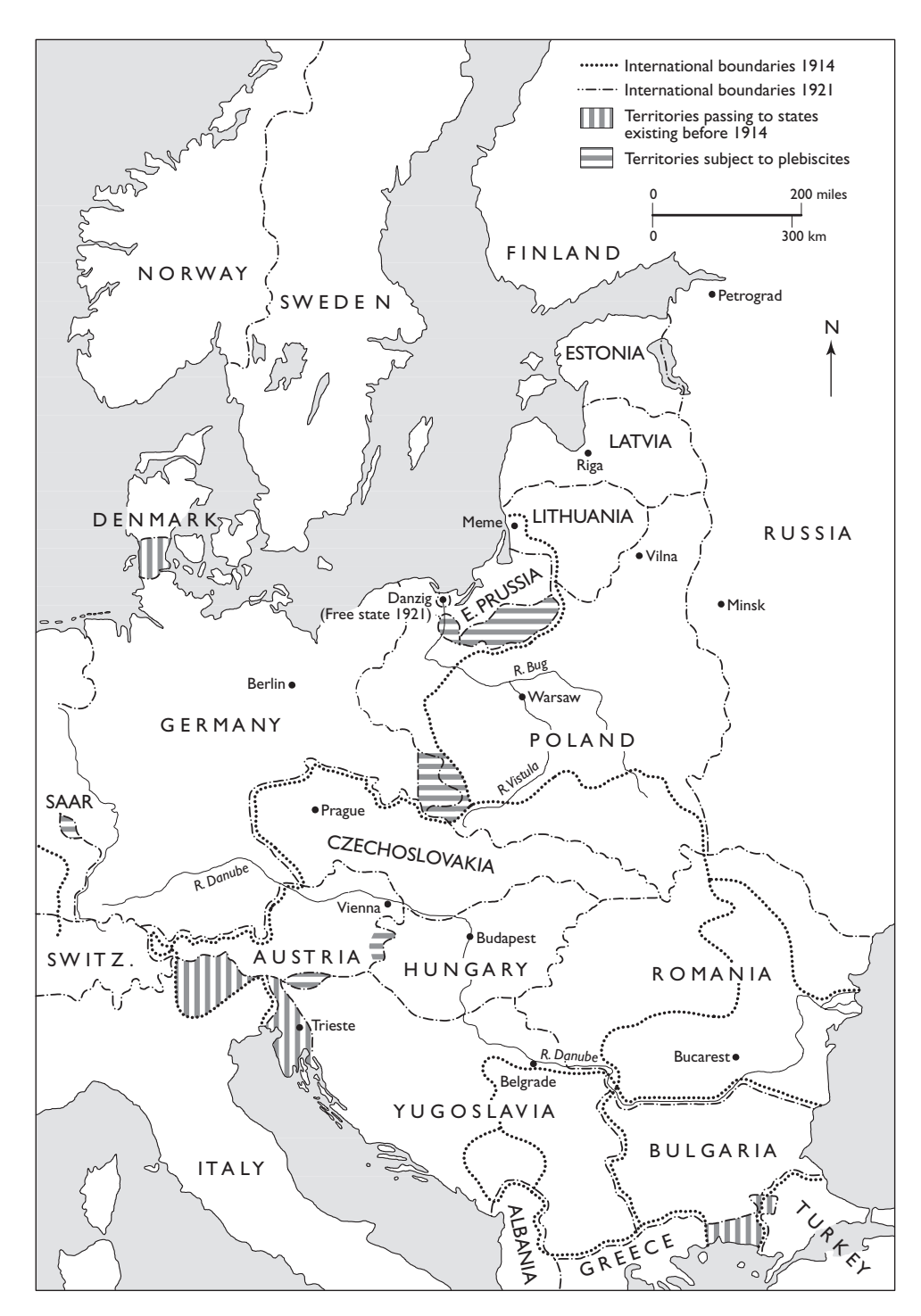
Map 2 The settlement of central and eastern Europe, 1917-22.