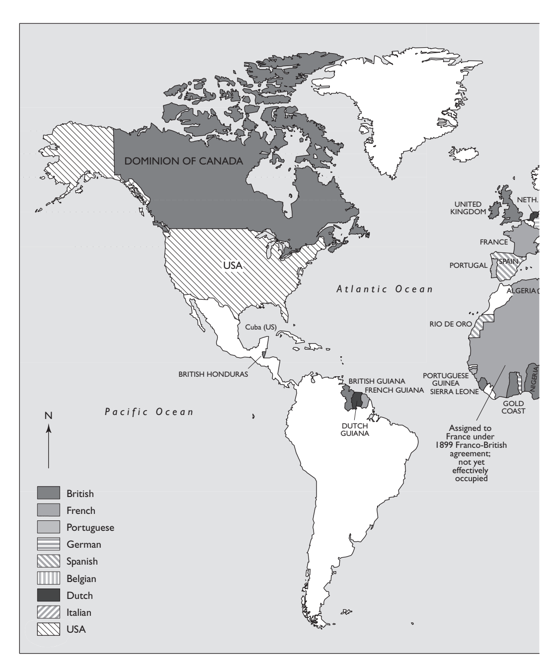
Map 1 European and American empires, 1901.