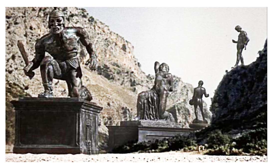
Sparta and its Law

The Spartan body was immediately distinguished for being very willowy, slender, dark-skinned not for race but for exposure to the sun, air, moisture; to dry, fresh and salt water, the skewers of vegetation, to stinging insects, dust, land, rock, snow, rain, hail and, ultimately, all kinds of weather. This would make the Spartan skin so stranded and hard as wood.