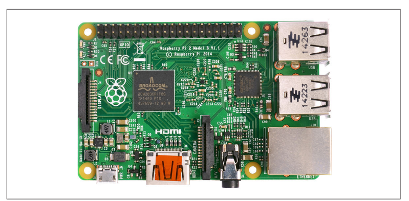
Figure 2-1. A Raspberry Pi (note the GPIO pins running across the top of the board)

Since then, Pythonic highlights for the Foundation have included contributions of code to the project. As you can see in Figure 2-1, the Raspberry Pi has general purpose input/output (GPIO) pins that allow users to attach and control external devices.