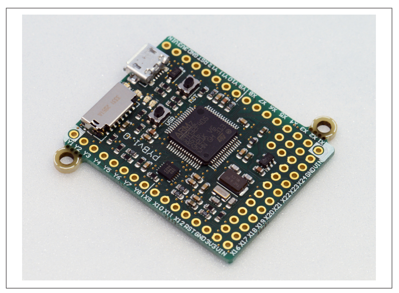
Figure 3-1. A MicroPython board (about the same size as a postage stamp)

The MicroPython project has created a pared-down version of Python 3 optimized for such devices, and provides a small electronic circuit board (see Figure 3-1) that runs such a svelte version of Python.