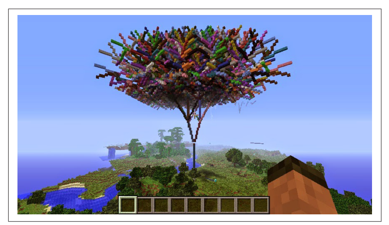
Figure 2-2. Multi-colored fractal trees created in Minecraft using Python running on a Raspberry Pi

The image on the front cover of this report was also taken at PyconUK. Notice the lack of adult supervision; this is a group of kids between the ages of 6 and 9 autonomously working out how to program Minecraft with Python. These are tomorrow's programmers inspired into programming today .