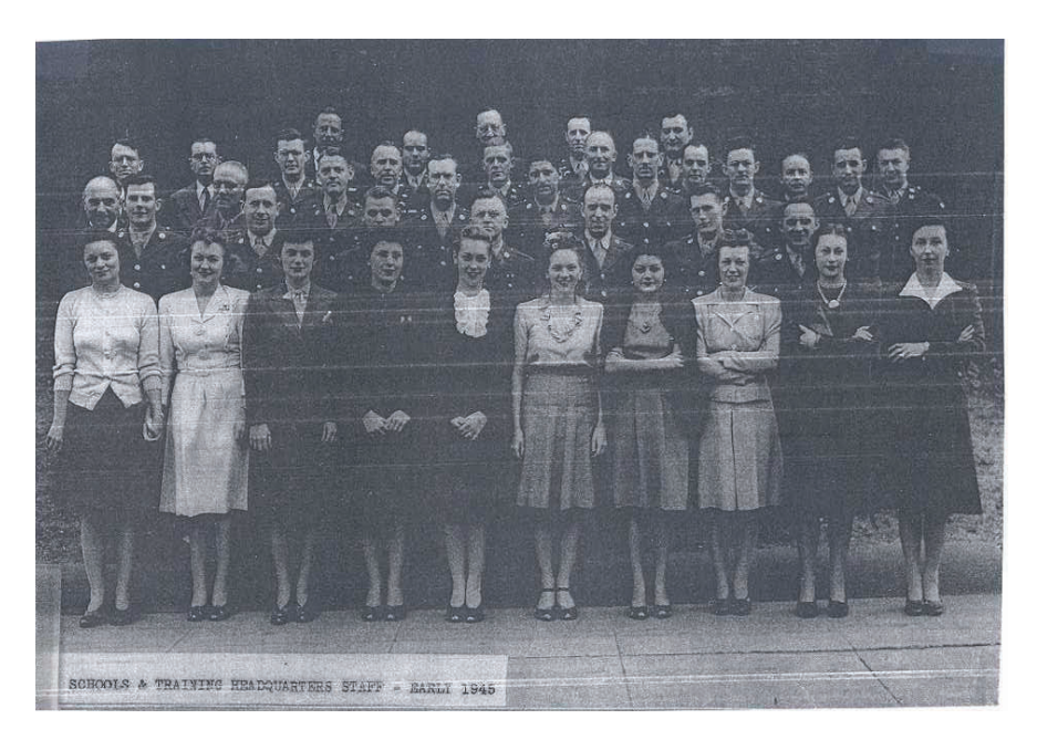
Schools and Training headquarters team, at its peak size, in early 1945.

OSS direct action training had its strengths and weaknesses; the latter, as even the Schools and Training Branch acknowledged, had been particularly evident in the early stages of its evolution. Until combat veterans began to return in the fall of 1944, few of the stateside instructors had any opera-