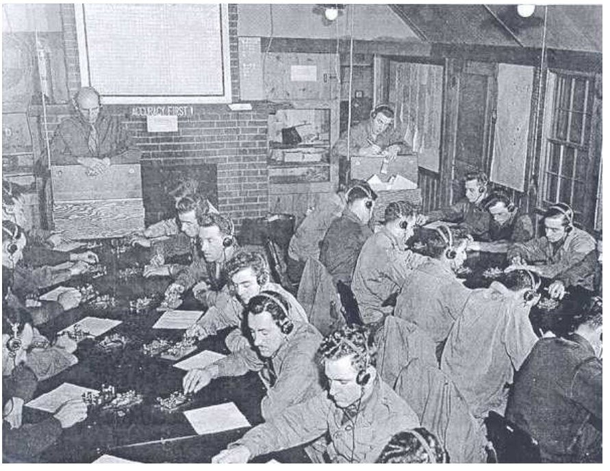
Communications school class in coded telegraphy at Training Area C.

Area E, two country estates and a former private school about 30 miles north of Baltimore, was created in November 1942 to provide basic Secret Intelligence and later X-2 training—as a result, RTU-11 became the advanced SI school. Area E could handle about 150 trainees. When the Morale Operations Branch was estab lished to deal in disinformation or psychological warfare, "black" propaganda, men and women of the MO Branch also trained at Area E, although men from MO, SI, and X-2 often received their paramilitary training in the national parks.<sup>30</sup>