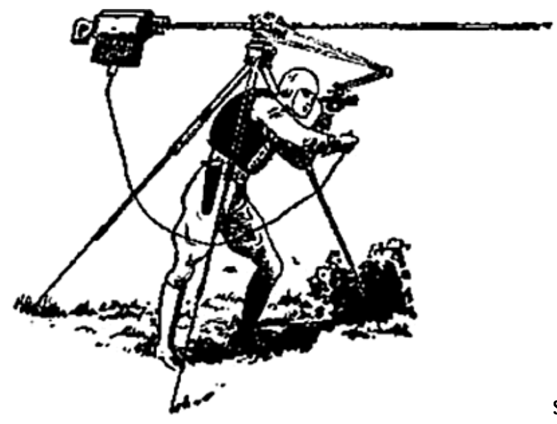
Setting his rocket gun for a long-

molecular vibration whatever. It reflects 100 percent of the heat and light impinging upon it. It does not feel cold to the touch, of course, since it will not absorb the heat of the hand. It is a solid, very dense in molecular structure despite its lack of weight, of great strength and considerable elasticity. It is a perfect shield against the disintegrator rays.