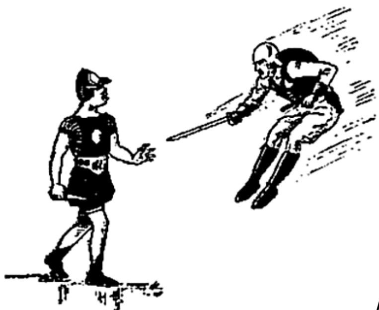
As the American leaped, he swung his

"We most certainly did," I reassured her. "All but one crashed and that one is drifting down toward the south; we've captured this one we're in intact. There was only one member of the crew aboard when we dove in."