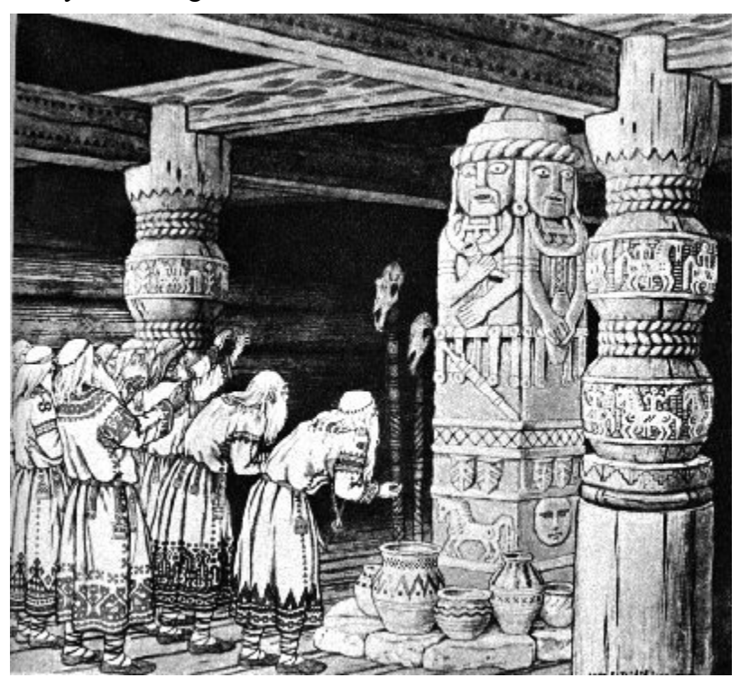
Temple of Swiantowid

Magic permeated every aspect of our ancestor's lives. The fields, forests, barn, bath and hearth were all ruled by spectral beings, sometimes good, sometimes horrible. Each flame and river was a goddess or god, each flower and stone a sentient being. The spirits of the dead too, filled the Slavic world. Life-draining wampyr, trees housing the souls of the departed, fairy-folk and ancestral spirits were an integral part of life, demanding respect and often, sacrifice. The Pagan Slav spent his entire existence tightly wrapped in a dark cloak of magic, mystery, and sometimes, terror. The spirits, after all, are always watching.