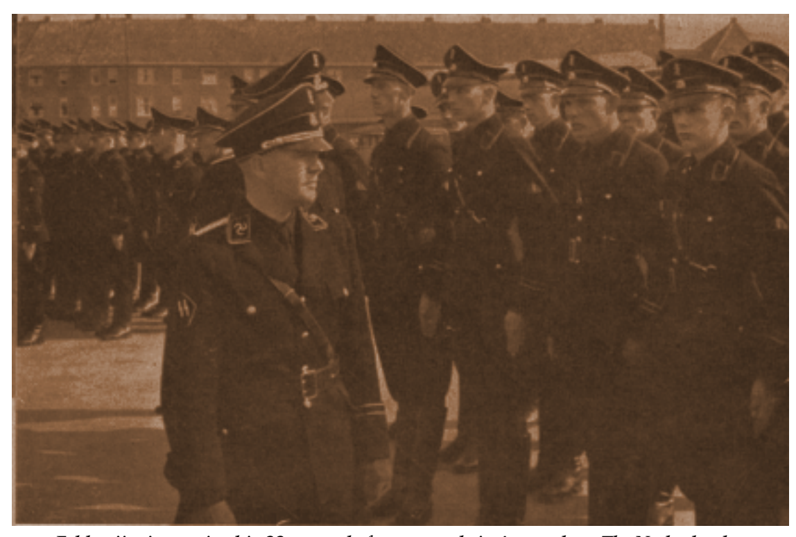
Feldmeijer inspecting his SS troops before a parade in Amsterdam, The Netherlands.