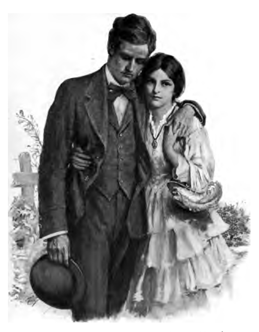
They came back to town, his arm about her shoulders, hers about his waist. FRONTISPIECE. Page 122.