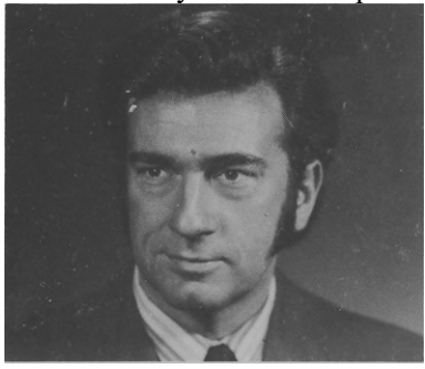
Originally published in French as Le Camp Des Saints, 1973

And when the thousand years are ended, Satan will be released from his prison, and will go forth and deceive the nations which are in the four corners of the earth, Gog and Magog, and will gather them together for the battle; the number of whom is as the sand of the sea. And they went up over the breadth of the earth and encompassed the camp of the saints, and the beloved city. —APOCALYPSE 20