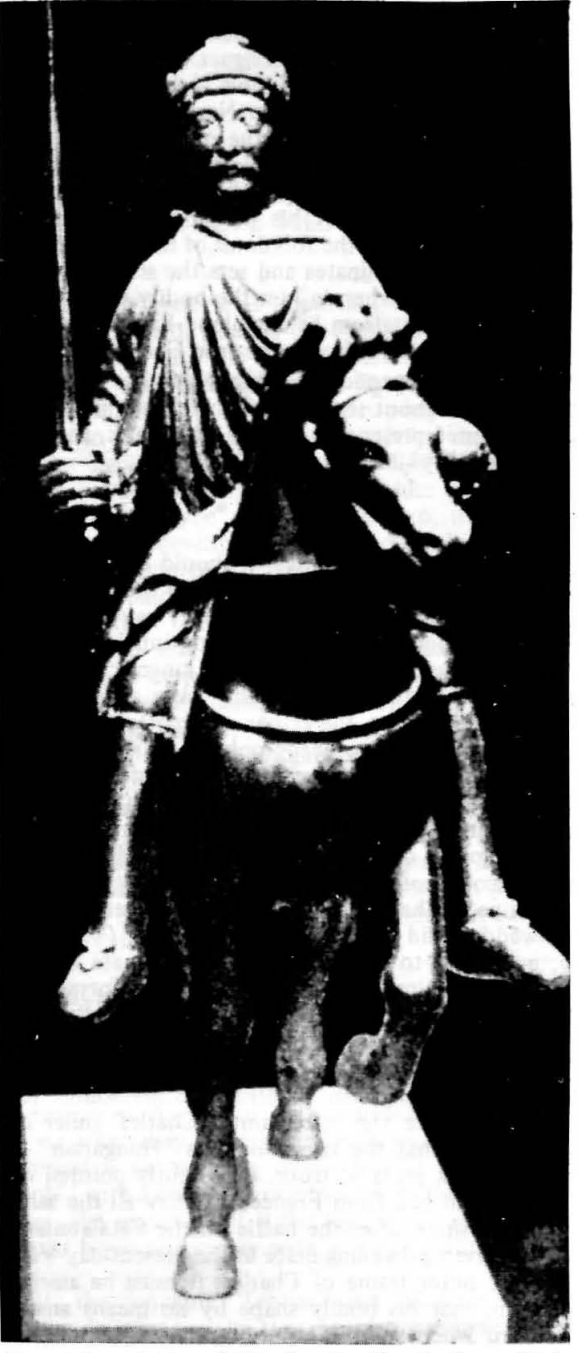
Equestrian statue of Charles the Frank, from Metz, now in the Carnavalet Museum, Paris. After Heyck: "Deutsche Geschichte", Bd. I.